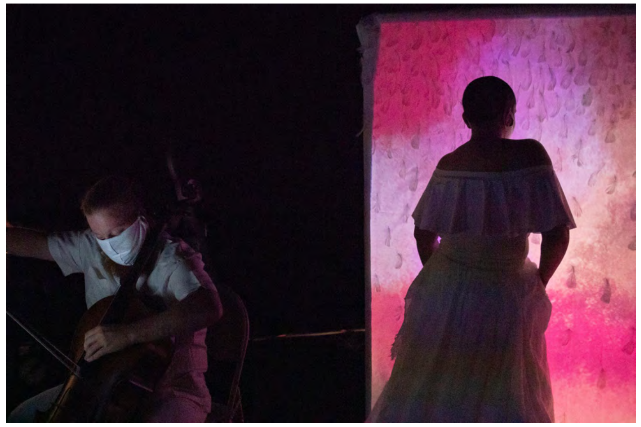
"Papillon" directed and with animation by Deniz Khateri. Photo by Jeffrey Means(August 2020)

this subject."(https://www.denizkhateri.com/)